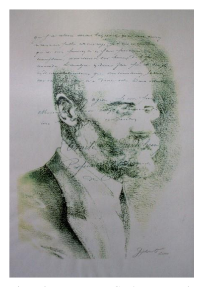
Fig. 3: Werner Gephart, Emile Durkheim (with his own handwriting, Bleistiftpastell) , 2000.

to the universalization of community, often thought to have been overcome in the globalization debate.<sup>17</sup> These do not only consist of the difficulty to transcend local and spatial commitments; they are also concerned with overcoming the ethnic tensions that are so closely connected with economic opportunities, which ultimately also means overcoming all sorts of class differences. Even if we accept the model of a pluralization of lifestyles as being at the very least combinable with the class model, this pluralization is in fact just the opposite egalitarian communalism. Integration of by 'plural differentiation', as one might read Durkheim's Division of Labor in Society, is no longer compatible with the idea of some