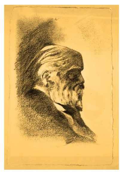
Fig 1: Werner Gephart, Ferdinand Tönnies (Yellow Version), 1998.

The relationship between law and community is of central importance to understand both spheres: Without having a legal community as the basis for sanctions and obligations, normative projections from professional guardians of justice amount to nothing; without legal penetration and consolidation, "imagined communities"<sup>4</sup> remain relevant as just that, imagined, and not as an actual force that shapes social life. If nothing else, such a force should 'integrate' highly complex societies and provide them with the resource of 'solidarity'<sup>5</sup> – without setting the limits of all solidarity with the 'limits of community' in the process.