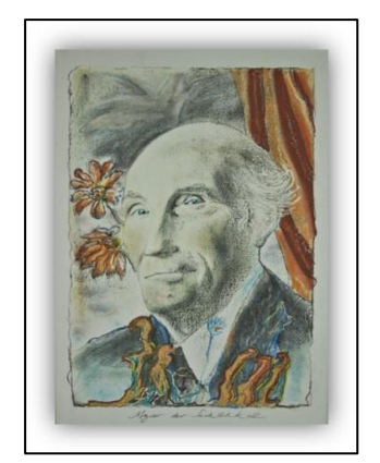
Fig. 5: Werner Gephart, Niklas Luhman – The Magican of Society (Sachlichkeit), 1997.