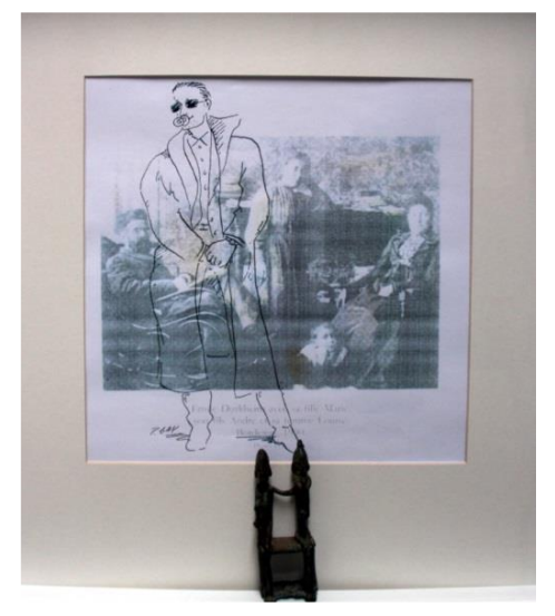
Fig. 7: Werner Gephart, La famille nucléaire, Émile Durkheim, his family (with a Dogon sculpture) [mixed media], 2013.

The principle of family solidarity, which today extends far beyond the concept of solidum , or joint liability, in Roman law, finds its normative expression in numerous legal orders – both in matrimonial alimony and, as intergenerational solidarity, in claims to relatives' support, not at least in the times of corona. Demarcation between these forms of legally institutionalized familial solidarity, on the one hand, and solidarity within society as a whole, on the other, meanwhile varies considerably in individual legal orders and cultures, particularly given that the legitimacy of post-martial solidarity is questioned in light of increasing gender equality and