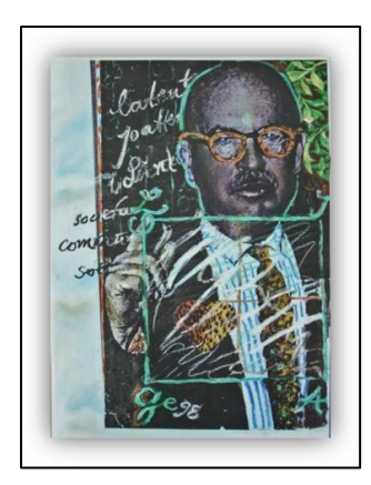
Fig. 4: Werner Gephart, Talcott Parsons as a pop artist , 1998.

provincial living and a cosmopolitan global community. The secret community theory behind the theory of communicative action by Jürgen Habermas is reflected in such a universalistic community of communication; and, especially in relation to the issue of law, insight can be gained on the sociologically burdened but nonetheless indispensable theory of 'community'.